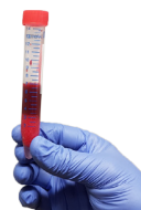
Fig. b - Before centrifugation