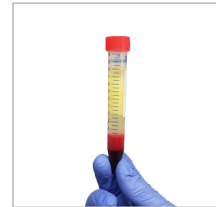
Fig. c - After centrifugation