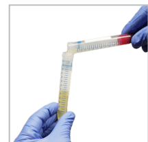
Fig. e - Collect cells