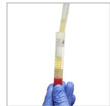
Fig. d - Remove plasma