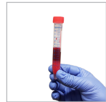
Fig. b - Before centrifugation